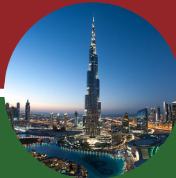
Company Incorporation in UAE